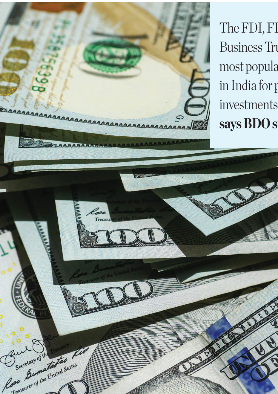
Benefits For Entities Setup In IFSC'.