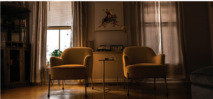
By SB Surendran

Feng Shui synchronises the surroundings and stimulates us with positive energy allowing us to live at our fullest potential. The energy within should resonate with the cosmic energy.